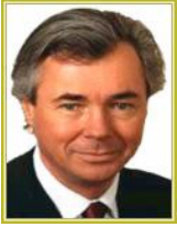
Honorable Pierre S. Pettigrew, PC, Chairman